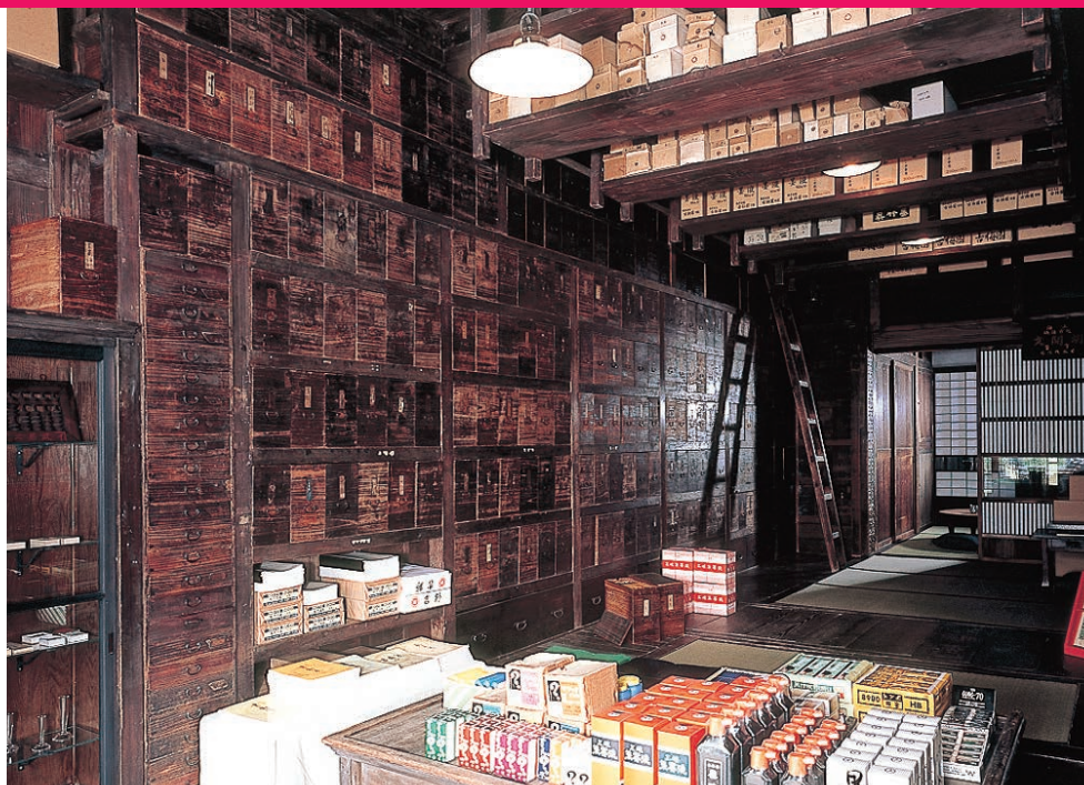
Edo-Tokyo Open Air Architectural Museum (Wed., Thu., Fri.)