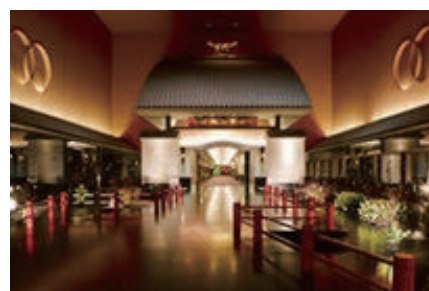
Hotel Gajoen Tokyo

FEATURE This hugely popular tour includes special entry to the advance-reservation-only Ghibli Museum. The museum features a plethora of exhibits including animation production processes and a Ghibli original short animated feature viewable only at the museum. The tour will stop by for a meal at Hotel Gajoen Tokyo, which inspired an important building in one of the Ghibli films, as well as Edo-Tokyo Open Air Architectural Museum where participants can experience an atmosphere just like a Ghibli movie.